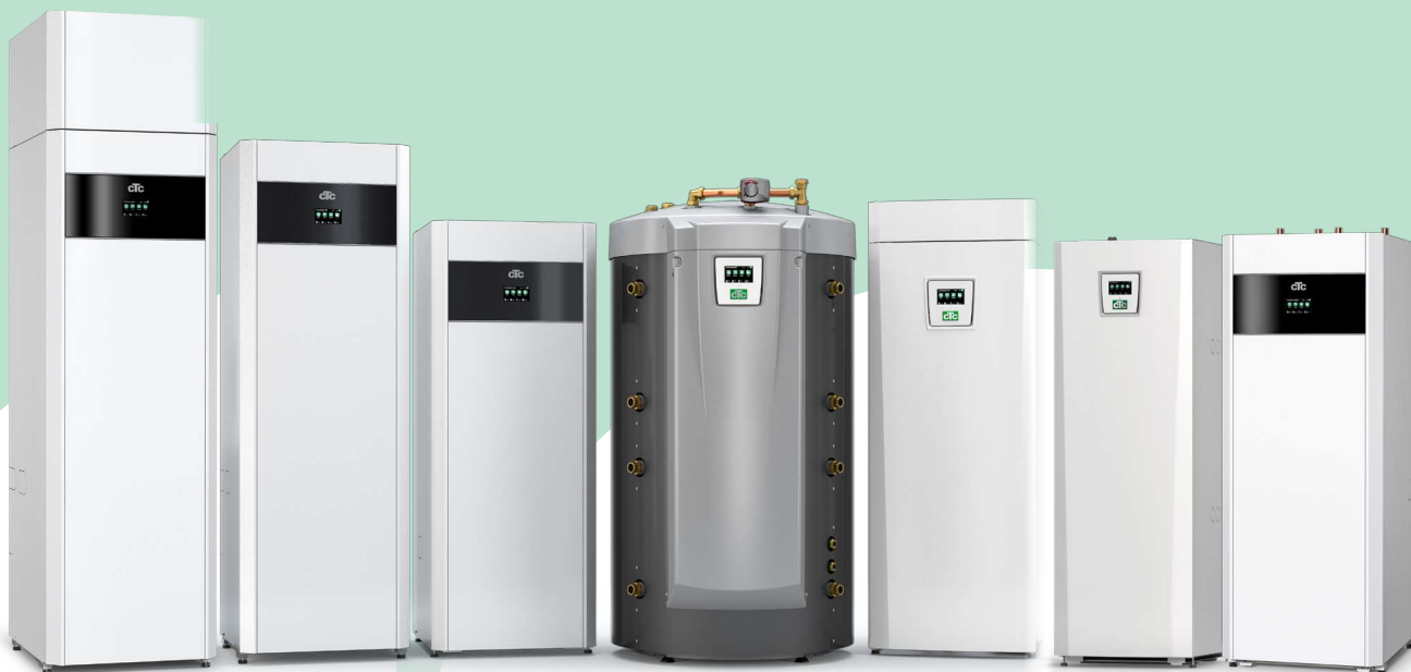
CTC EcoVent i360F

– refer to individual product sheets for more detailed information.